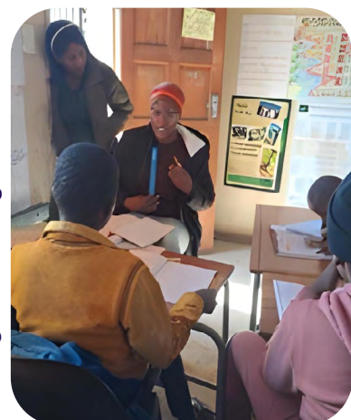
Learners being accountable for an assignment in South Africa