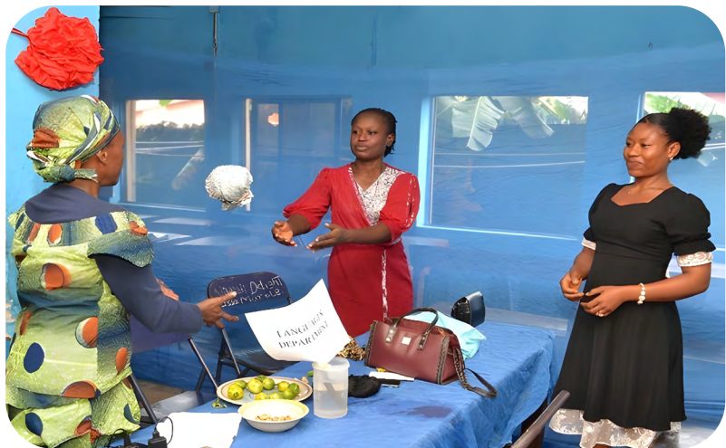
The egg experiment in practice (Owerri, Nigeria)

From the above questions and activities, English Language teachers, teachers of other school subjects and leaders in different spheres of life should learn to be accountable themselves before directing and molding learners and others towards being accountable