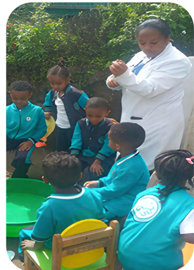
A teacher giving clear instructions to pupils in Ethiopia

As a realistic educator, identifying potential difficulties in advance and planning appropriate strategies to mitigate them during the lesson is a pre-lesson activity that can make 'during-lesson' activities seem easy.