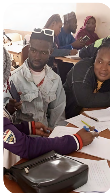
Students working in groups to do class activity in Nigeria

Physical activities, short breaks and other mental exercises have a way of refreshing the mind; they also help the teacher to maintain high energy levels because recreational activities put the teacher in a more relaxed and resourceful state.